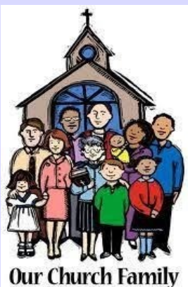
Our Church Family